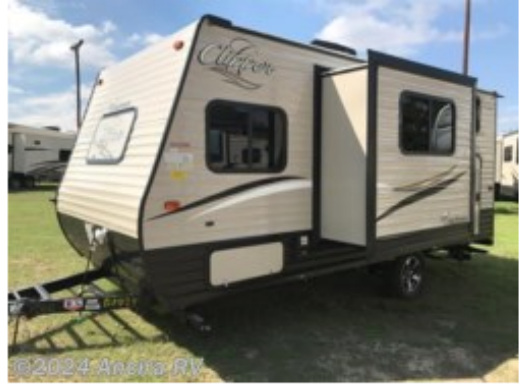
©2024 Ancira RV