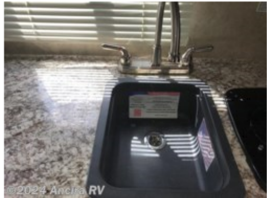
©2024 Ancira RV