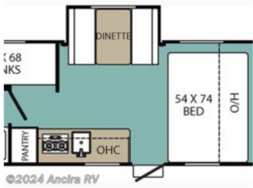
©2024 Ancira RV