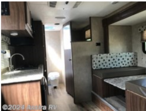
©2024 Ancira RV