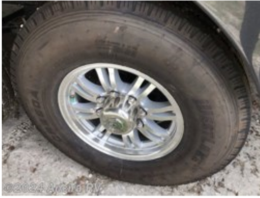
©2024 Ancira RV