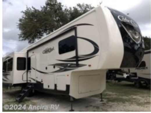
©2024 Ancira RV