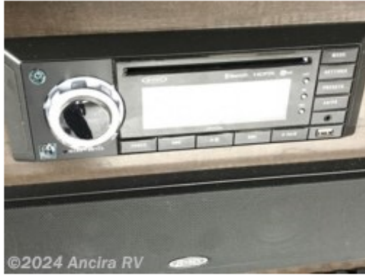
©2024 Ancira RV