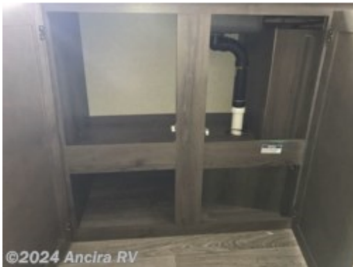
©2024 Ancira RV