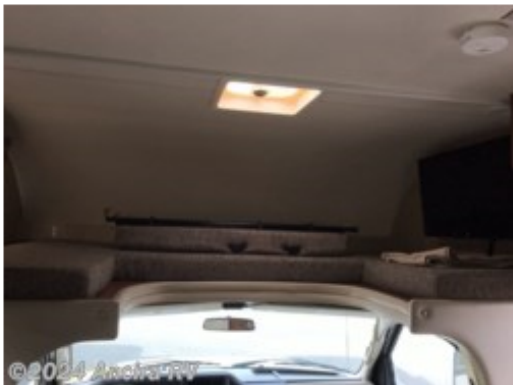
©2024 Ancira RV