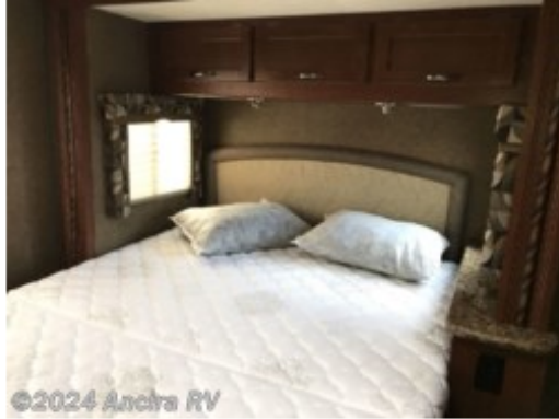
©2024 Ancira RV