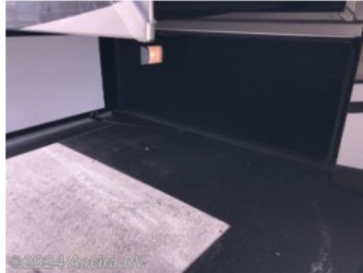
©2024 Ancira RV