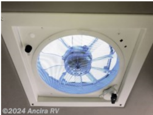
©2024 Ancira RV