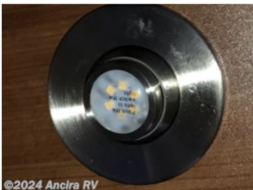
©2024 Ancira RV