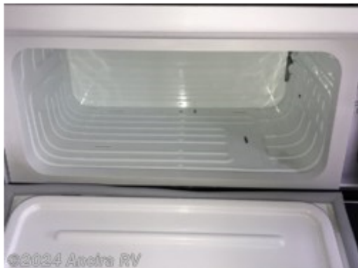
©2024 Ancira RV