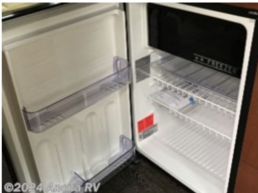
©2024 Ancira RV