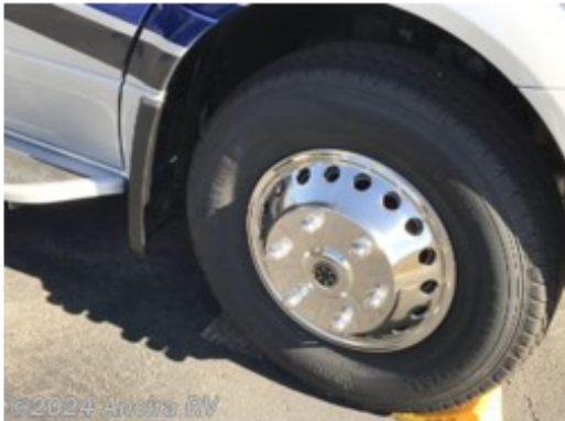
©2024 Ancira RV