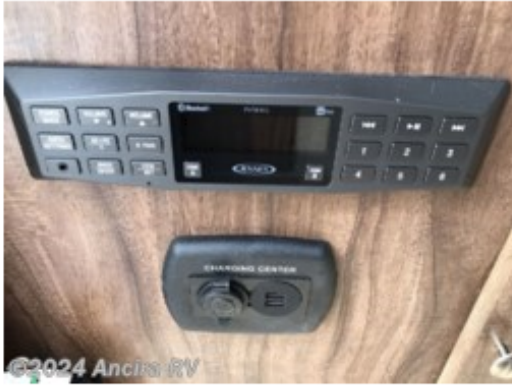
©2024 Ancira RV