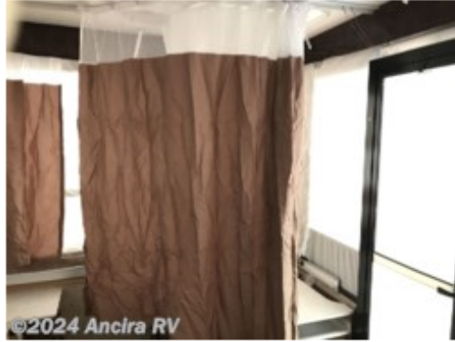
©2024 Ancira RV