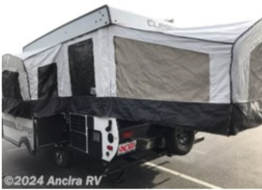
©2024 Ancira RV