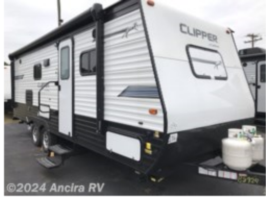
©2024 Ancira RV